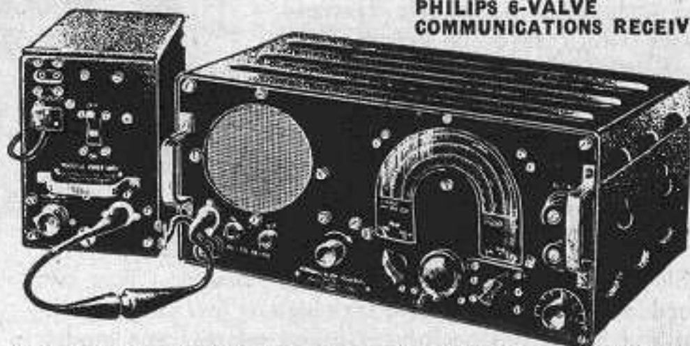
PHILIPS 6-VALVE COMMUNICATIONS RECEIVER

16-50, 200-550 and 800-2,500 metres. R/F, F/C, 2 I.F.s D.D.T. Pentode Output. Spin-wheel tuning. In black metal case with built-in speaker. Complete with power pack, A.C. 200-250 v. Can also be supplied with 12 v. D.C. power pack if required. BRAND NEW—EX-GOVT.